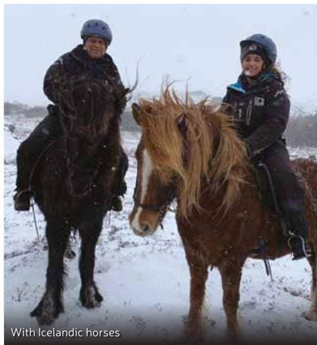
With Icelandic horses

During our visit to Tanzania, my dad and I went on a trail ride and we got to ride up close to a herd of zebras grazing! It was so surreal to be so near to them outside of a motorized vehicle. It was also lovely walking through the Tanzanian terrain - at the end of the trail we got to gallop through the grassland. While my most memorable experiences riding abroad have been in Tanzania and Iceland, I have also ridden in a variety of other countries, such as Australia, Turkey, New Zealand and India. I hope I will be able to come across similar opportunities to ride in Spain and Morocco when I visit this summer.